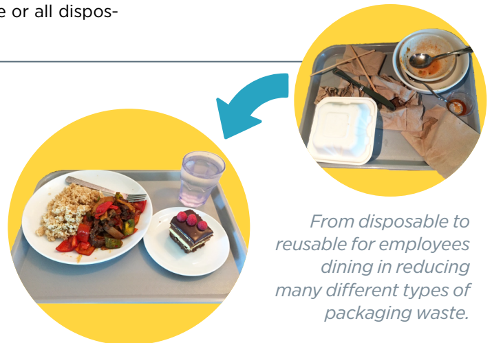
From disposable to reusable for employees dining in reducing many different types of packaging waste.

Bon Appétit reported two cost impacts to the changing operation: $20,675 one-time initial set up cost to purchase new reusable food ware items and supplies, and $24,000 in annual ongoing cost to sustain the operation to cover additional washing supplies, labor, and replacement of broken, lost, or damaged food ware. Bon Appétit trained staff to default to reusables at made-to-order stations, prioritized the use of reusables at self-serve stations, and eliminated some disposable items all together.